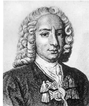
Daniel Bernoulli, 1700-1782

Flow Research, Inc. 27 Water Street Wakefield, MA 01880 United States [1] 781-245-3200 [1] 781-224-7552 (fax) www.flowresearch.com